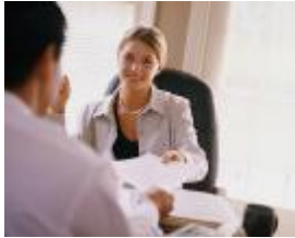
Meet with a WIA Case Manager to find out more.

Funds are available to assist you. The Workforce Investment Act (WIA) program sponsors a variety of training and support programs through selected service providers. Services can include job search assistance, resume preparation, classroom training, on-the-job training assistance, and necessary support services to help you get back on the road to employment.